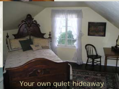
Your own quiet hideaway

Also included is Floyd's Cabin, a recently renovated barn. Cozy and fully self-contained, enjoy privacy and exclusivity