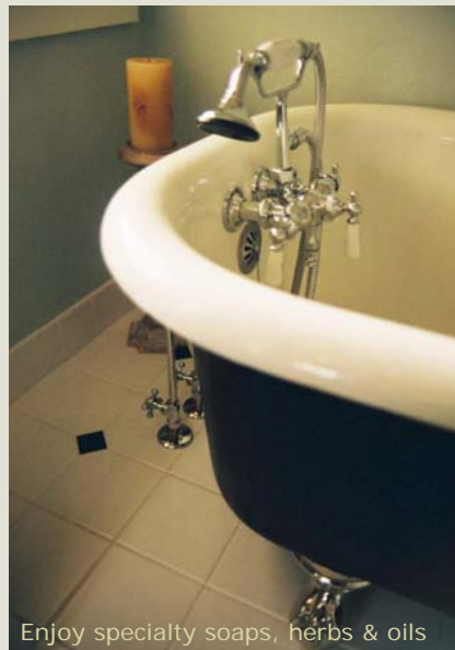
Enjoy specialty soaps, herbs & oils